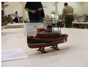
Harbor Tug Boat by Ron Verburg Eagle Squadron IPMS 1 st place ships Ocean Liners / Commercial