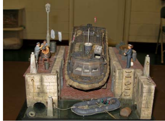
Ed Kennedy - Best K-9 Best Actual Dog "The Captain's Bath" diorama