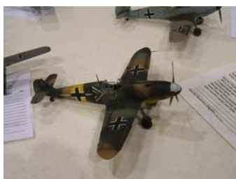
Bf109 G-2 1 st place Single Engine Prop Axis by Wayne Davidson IPMS Winston-Salem