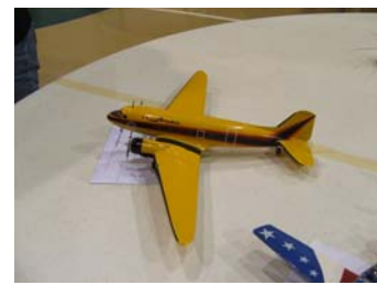
Austin Air DC-3 by Chip Jean IPMS Tidewater 1 st place Aircraft Civilian / Racing / Airliners