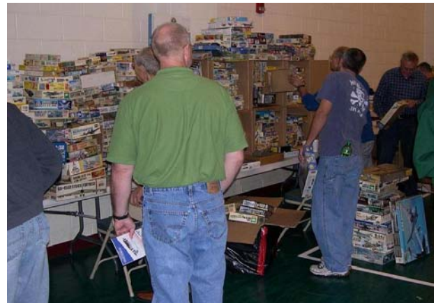
...and all those great guys at Lynchburg!