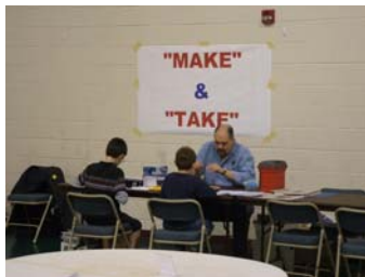
Make & Take continues