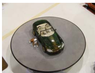
Revell Dodge Viper SRT-10 by Larry Landis 3 rd place Auto – Out of Box Central Pennsylvania Model Car Club