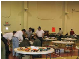
Judges at work