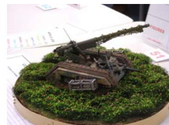
Imperial Guard Griffon 1 st place Miscellaneous by Brian Staples