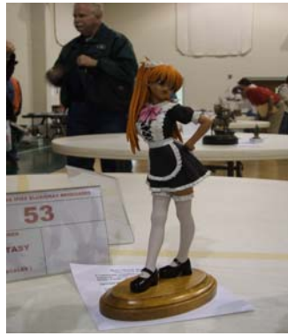
"Asuka" 2 nd place Figures Fantasy by Steve Simmons IPMS Tidewater