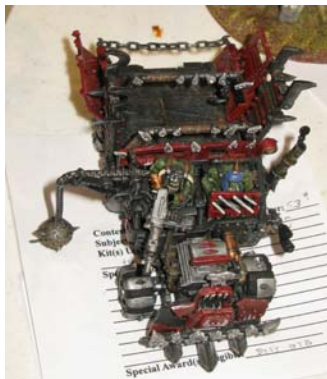
Ork Wartrukk by Tracy Tuck Blue/Gray Renegades