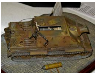
Sturmtiger 38 cm mortar by C.R. Casey