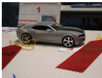
Camaro Concept Car 2 nd place Auto by Carl Pyles