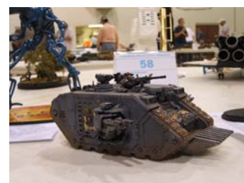
Space Marine Lander 3 rd place Sci-Fi by Tracy Tuck Blue/Gray Renegades Lynchburg