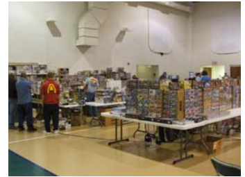
The vendors with goodies piled high