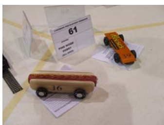
Pinewood Derby winners Hot Dog by Emmie Summy 1 st place Reese's Car by Lilly Summy 2 nd place