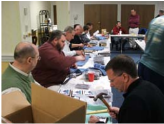
Before the big dance club members assembling plaques during build night