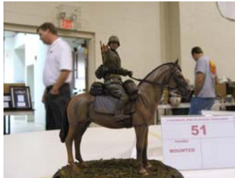
Florian Geyer Cavalrman by Brian Staples 1 st place Figures mounted