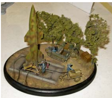
Wasserfall Rocket Spanky McFarland Space/Missile/Rocket IPMS Eagle Squadron