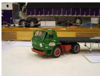
Mathew Fifer's Dodge L700 w / flatbed trailer 2 nd place Auto Semi-Trucks