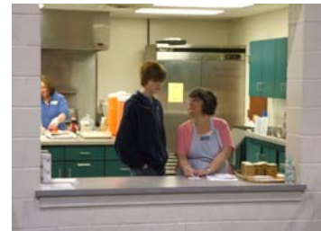
Lunch options were great