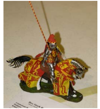
Owen Glendour 2 nd place Figures Mounted by Rich Maxham Lynchburg Blue/Gray Renegades