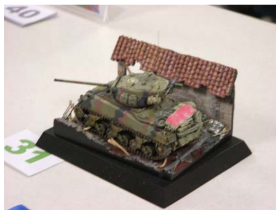
"Sherman in Color" 1/72 nd scale DML Best-n-show by Jay Cesafskey