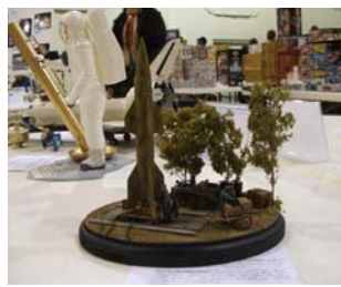
WasserFall rocket by Spanky McFarland Eagle Squadron IPMS Space / Missile/ Rockets 1 st place