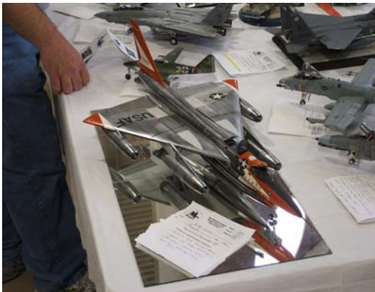
B58