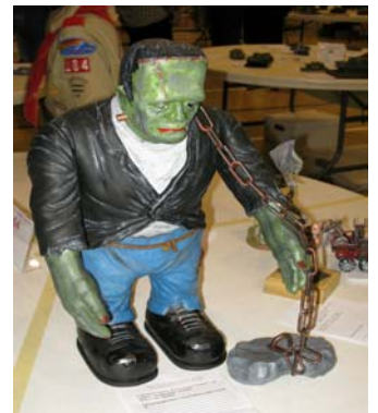
Frankenstein Moebio by Donald Worley Richmond IPMS