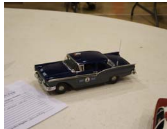
'57 Ford Blue & Gray by Mike Rorer Lynchburg Blue/Gray Renegades