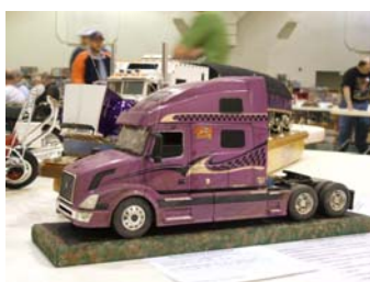
Volvo tractor Semi-Truck by Hunter Selby