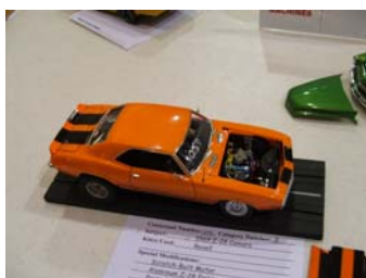
1969 Z-28 Camaro Street Machines by Jack Bouman Central Pennsylvania Model Car Club