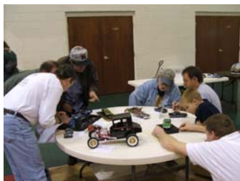
Judging teams in close examination of the auto entries