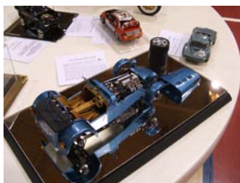
Lotus Super 7 by James Green Auto – other competition 3 rd place IPMS Winston-Salem