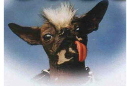
Scurvy the Wonder Dog....

Lynchburg Blue/Gray Renegades annual show and contest was held on March 28 at Heritage United Methodist Church in Lynchburg, Va. The event