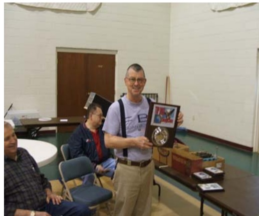
Ed Kennedy – TOP DOG The best entry of a dog of a kit "The Captain's Bath"