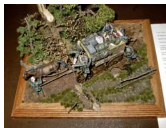
"Lost Cause" diorama 2 nd place Military Diorama Brian Staples Blue/Grey Renegades