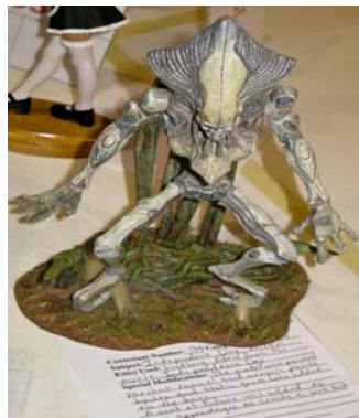
Independence Day Alien 3 rd place Figures Fantasy Larry Landis Central Pennsylvania Model Car Club