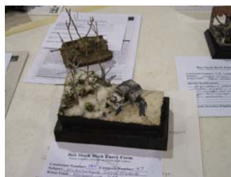
Kubelwagon Snowmobile by Bill Herd Baltimore IPMS 3 rd place Armor Small Scale