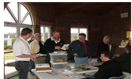
Registration begins in style