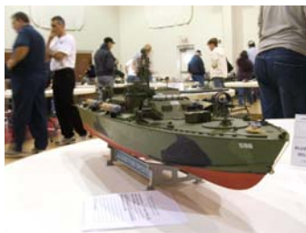
Elo P.T. Boat by Donald Worley 1 st place Ships 1/350 th and larger Richmond IPMS