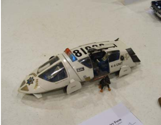
Amtronic Police Interceptor K9 unit by Larry Landis

Dog – (Noun) Any subject built or used that represents a poor design or execution. Documentation is a good ideal!