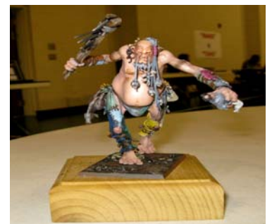
"Frankie the Giant" Brian Staples Figures Lynchburg Blue/Gray Renegades