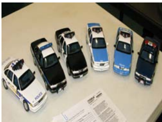
Police cars Gary McDowell 1 st place Collections