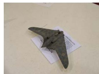
Pioneer Gatha Go 229 wing Aircraft Jet 1/49 to 1/72 by Larry Landis Central Pennsylvania Model Car Club