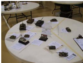
Armor decorated the tables