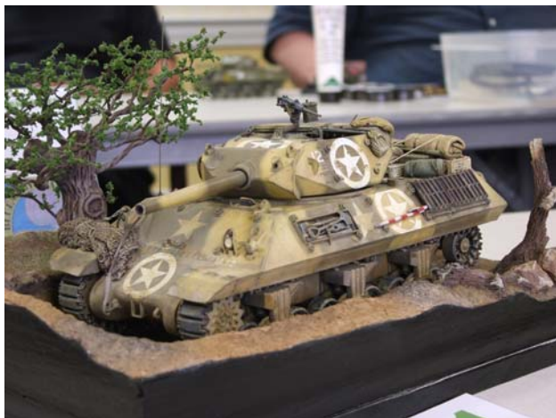
M10 Tank Destroyer at Anzio BEST IN SHOW by Jay Cesafskey