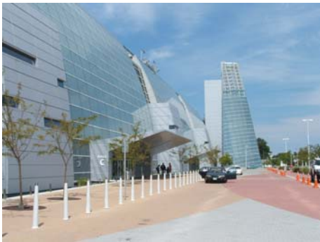
The Convention site