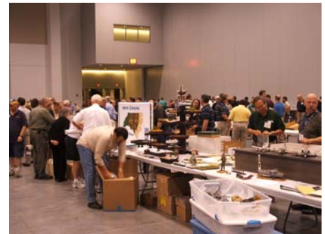
Time to go home