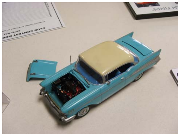
'57 Bel Air THE 50'S THEME AWARD WINNER by Robert Compton